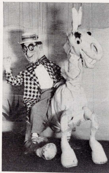
Here's one of the stars in the Sue Hastings Marionette Show, appearing five times daily in the Chrysler Theater. It is one of the Exposition's free attractions.

Paris, Streets of All Nations, Black Forest and several other spots offer revues and entertainment of high caliber to their patrons.