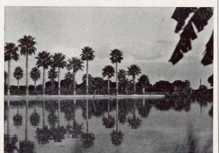
Palms Line Highways of Gulf Coast Plains

Just beyond the 200-mile radius from the Exposition at Dallas, travel along the coastal plains leads to Houston, named for General Sam Houston, once capital of the Republic. Now as the largest city in Texas it en-compasses old Harrisburg. Its deepwater channel down Buffalo Bayou, 55 miles to tidewater at Galveston, island city once the rendezvous of the pirate Jean LaFitte, passes San Jacinto bat-tleground where Texas indetleground where Texas inde-pendence was won with the routing and capture of Santa Anna on April 21, 1836. Celebra-tion during the ten days pre-ceding and climaxing on San Jacinto Day this Centennial year is planned on a gala scale.