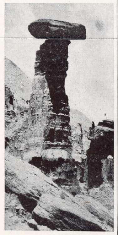
Devil's Tombstone, Palo Duro

This jaunt carries almost out of a circle 500 miles from Dal-