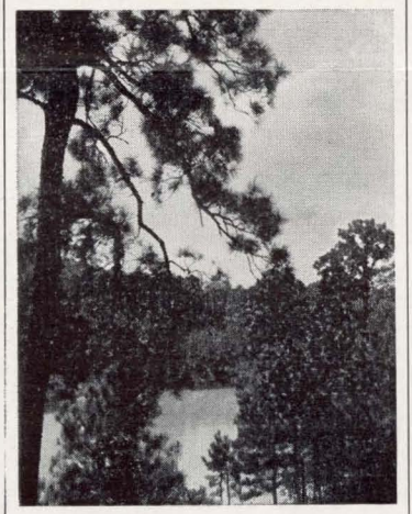
Tall Pines Stud East Texas

Richness of that red sand nurtures a great tomato-growing section, and watermelons-what