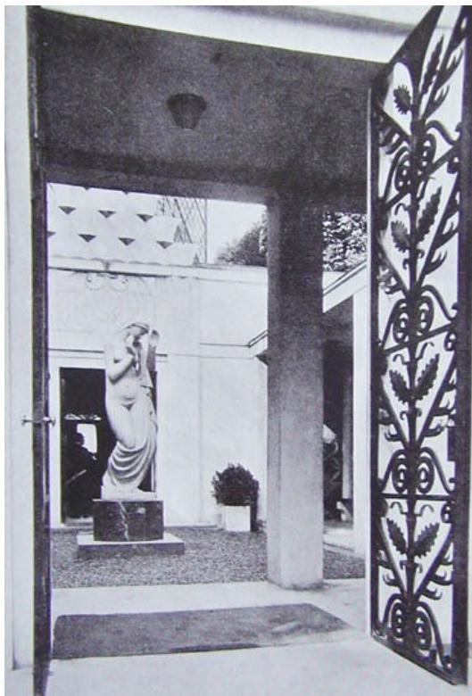
The entrance to the Polish pavilion

The Primavera Pavilion, inspired by African thatched huts.