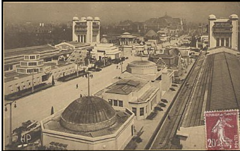
A postcard of Paris in 1925 showing the exposition buildings on the left bank of the Seine.

The exposition took over a huge portion of the city. Pavilions and avenues of boutiques spread across both sides of the river Seine, which runs through the center of Paris. Twelve monumental entrances led into the heart of the fair. By day, these sights and shops enticed visitors by the thousands. At night, the entire city came alive, truly earning its name, “The City of Lights.”