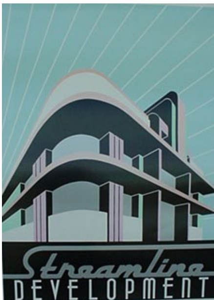
Art Deco design after "streamlining"

Following the Great Depression, Art Deco proved to be an adaptive style. Its practitioners no longer embellished their art and architecture with the florid details of the French-inspired decorative style; rather, this second phase of Art Deco underwent a treatment known as “streamlining.” Designs became angular and machine-like, forging a style that seemed both more modern and more appropriate to the sober times wrought by economic hardship.