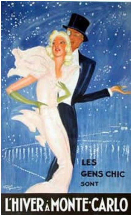
Travel poster in the early French Art Deco style